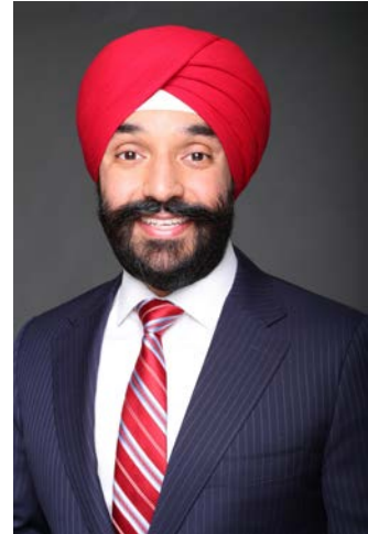
The Honourable Navdeep Bains Minister of Innovation, Science and Economic Development

Together with Canadians of all backgrounds, regions and generations, we are building a strong culture of innovation to position Canada as a leader in the global economy.